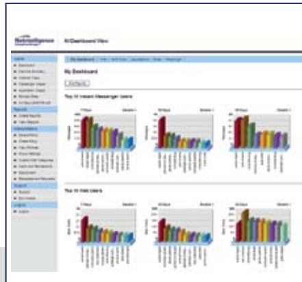
1. Complete Overview Dashboard

Ni Enterprise Manager provides you with the information that you need to ensure that your business is safe and secure 24 hours per day 7 days per week.