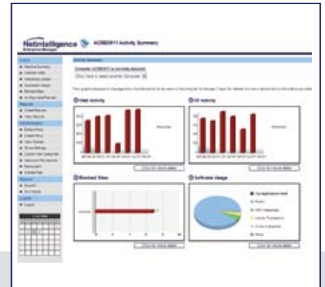
2. Individual Activity Summary