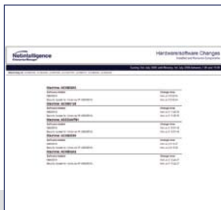
4. Hardware/software Changes