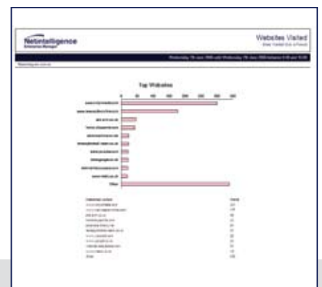
8. Websites Visited