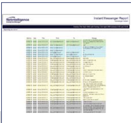
6. Instant Messenger Report