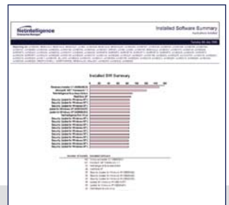
5. Installed Software Summary