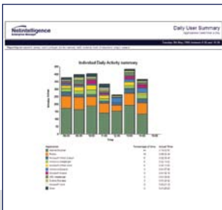
3. Daily User Summary