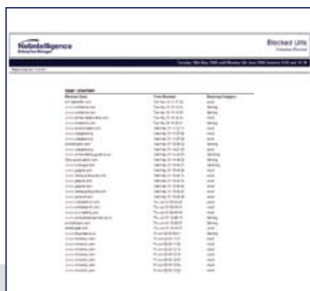
7. Blocked Urls