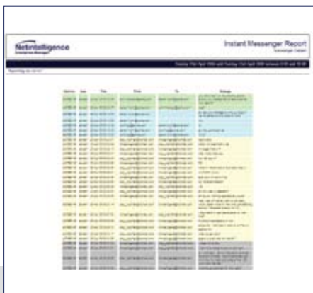
6. Instant Messenger Report